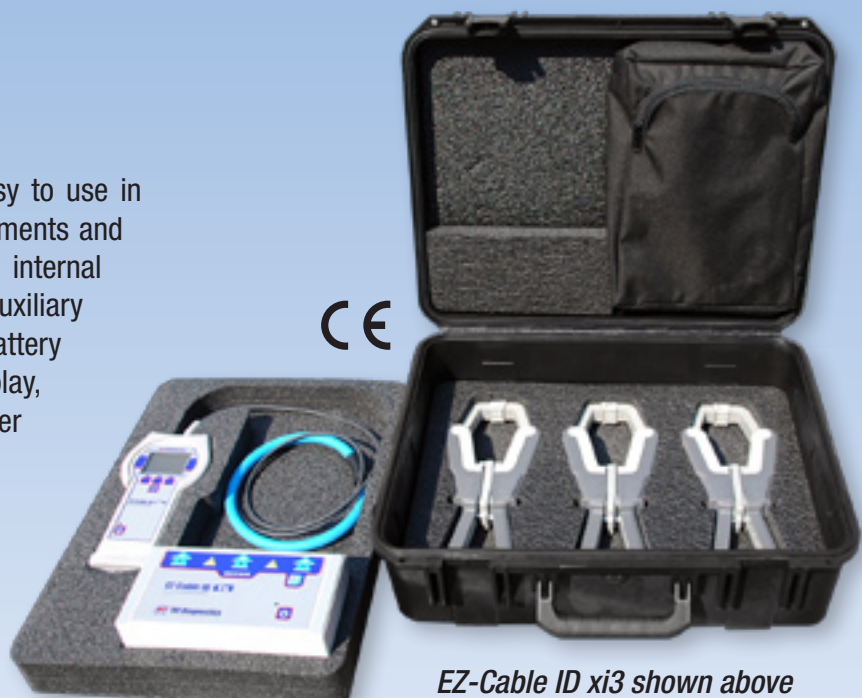
EZ-Cable ID xi3 shown above

The instrument is extremely easy to use in both day and night time environments and can be powered by either the internal battery, AC mains or from an auxiliary 12V DC supply. The receiver is battery operated, has a backlit LCD display, housed in a rugged rubber holster and has a flexible pickup coil to easily wrap around cables.