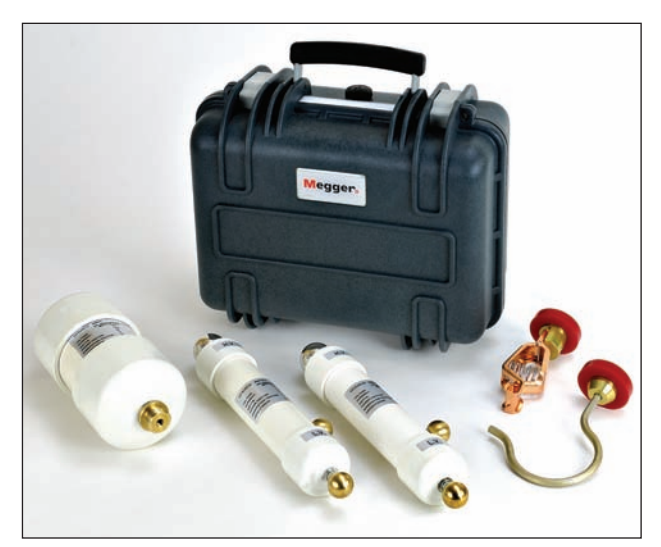
Optional capacitor kit includes carry case, TTR capacitor (left), and 2 reference capacitors (center). Also shown are 2 connectors (right) that will work with the capacitors and are supplied with the DELTA2000 unit