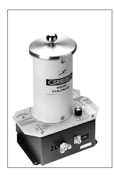
The optional Calibration Standard traceable to the NIST for quick operating or calibration checks of test set bridges calibrated in watts loss or in dissipation factor