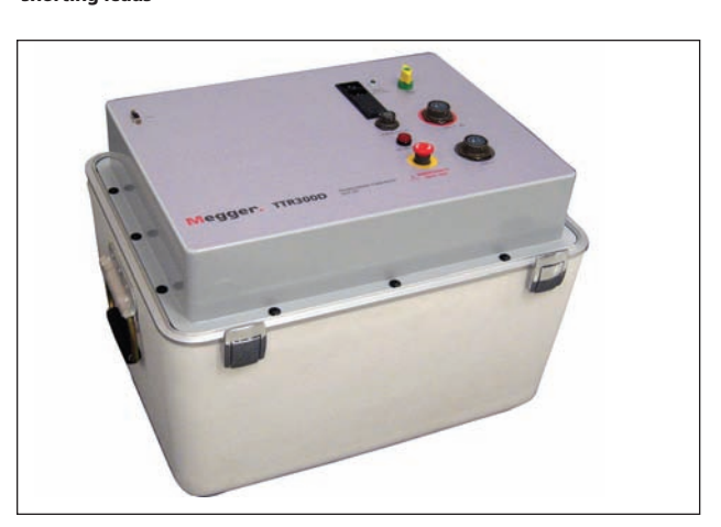
Optional TTR300D module, for LV three-phase TTR testing, installed inside DELTA HV cabinet. (Lid not shown for clarity.) Via PowerDB software, TTR testing is in accordance with Megger TTR300 product specifications. External laptop is easily placed on top surface of module for added convenience.