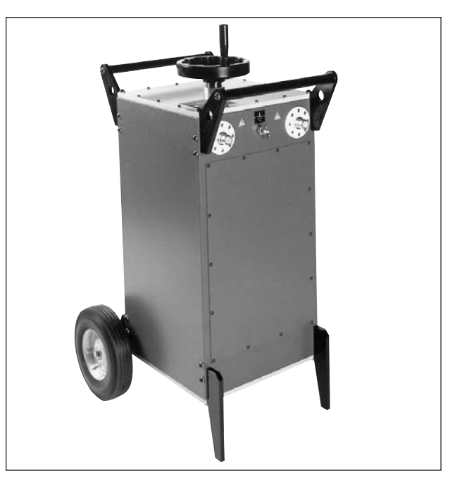
The optional Resonating Inductor expands the capacitance range of the <code>DELTA2000</code>