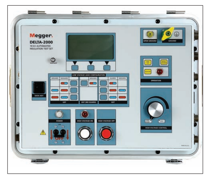
Close-up of DELTA2000 panel