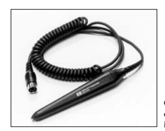
Optional bar code wand for recording an alphanumeric test identification