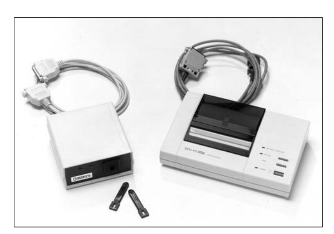
Data Keys with PC interface box and standard thermal printer