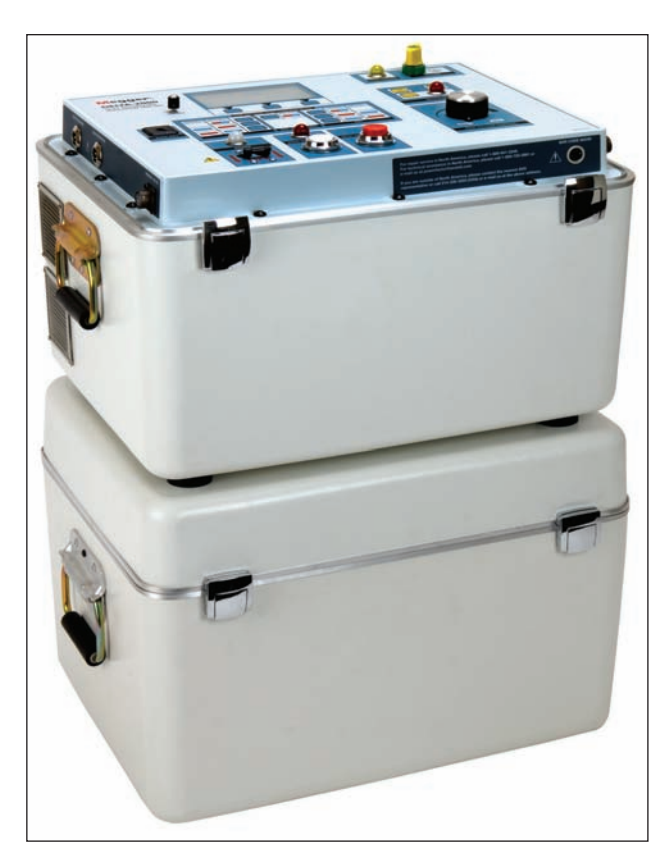
The DELTA2000, available in either 120 or 240 V ac/50 or 60 Hz, includes the Control Unit (top) and High Voltage Unit (bottom)