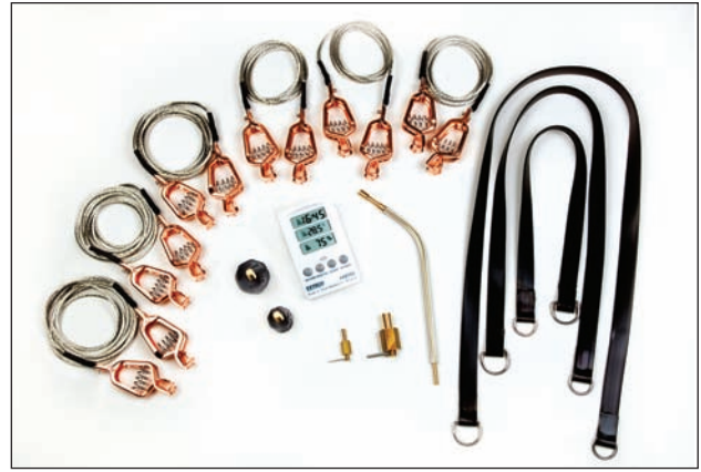
The optional accessory kit, C/N 670501 includes mini bushing tap connectors, hot collar straps, temperature/humidity meter, .75" bushing tap connector, 1" bushing tap connector, "J" probe bushing tap connector, 3-ft non-insulating shorting leads, 6-ft non-insulating shorting leads