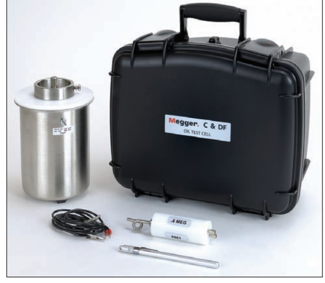
The optional Oil Test Cell, C/N 670511, is used for testing insulating fluids up to 10 \mbox{kV}