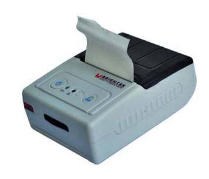
Optional thermal printer for instant print-out