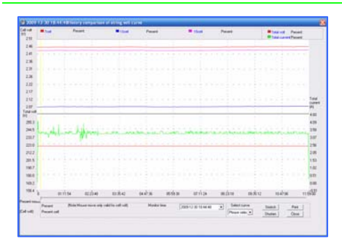
Discharging curves of each cells