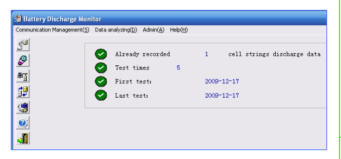
Simple interface with short-cut keys

All standard load units of PITE 3980 come with analyzing software. Real-time data monitoring (with DAC), testing data analyzing and report printing are all available with the PITE DataView software.